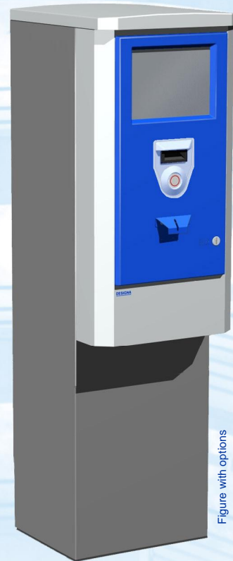
Figure with options